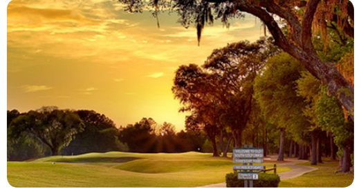
South Carolina Campus Hilton Head